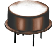
CASE STYLE: PP120 PRICE: $73.95 ea. QTY (1-9)