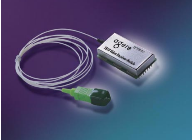
The broadband 7810 video receiver module is a versatile, state-of-the-art solution for a variety of network applications.