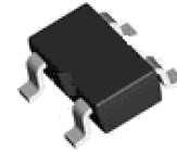
Package (SOT-143) Marking " CDA4 "