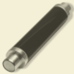
6 / 12KV