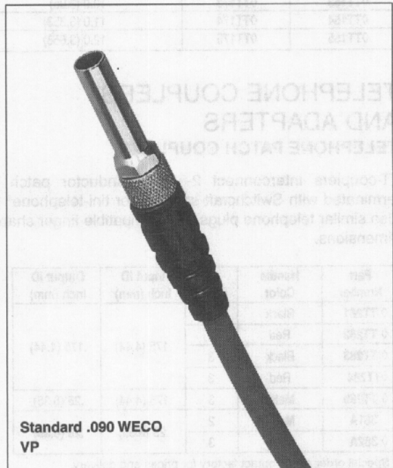
Standard .090 WECO VP