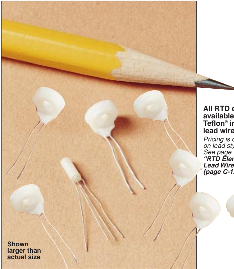
Shown larger than actual size

All RTD elements available with Teflon® insulated lead wire.