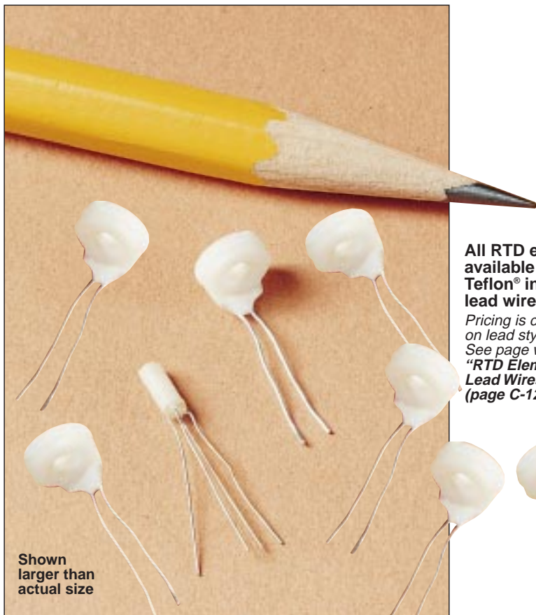
Shown larger than actual size

All RTD elements available with Teflon® insulated lead wire.