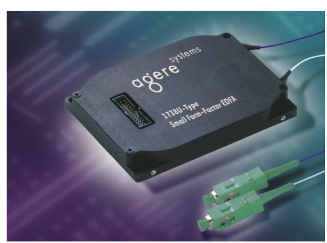
Compact size and extremely low power consumption make the 1738U-Type EDFA an ideal solution for single-channel, preamplification applications in C-band.